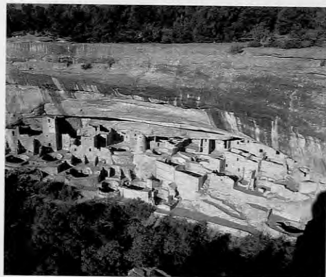
Cliff Palace, Mesa Verde