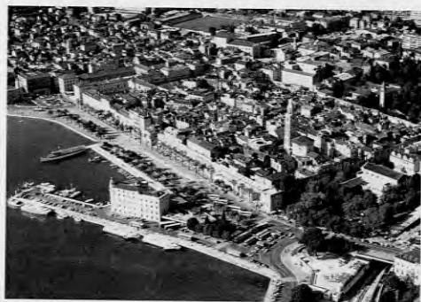
Diocletian's Palace in Split

It is however incriminating enough that such sentimental associations were able to blur the essential meaning of the word-image. Incriminating with regard to the intellectual feebleness of these readers! The word-image as such has nothing to do with what they and others thought fit to label 'casbahism'.